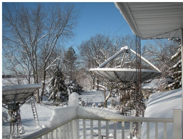
More dishes in the snow!

9.3. Participants of the competitions who have fulfilled the conditions of the award «EME Russia» during the contest will be awarded electronically without additional application.