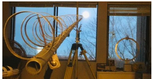
N1FSK's EME indoor operating position

N1FSK: Sandy sarlon2@icloud.com has returned to EME after 31 years -- After an absence of over 30 years from 2 m CW EME (old call WA1FSK), I am QRV on 1296 with my new call N1FSK. Just before the ARRL Contest on 17 Dec, I completed with old friend, HB9Q (14DB/24DB) using Q65C. I am using an indoor 76 el loop yagi sticking out from my high-rise apartment living room window. Because of the window's location, I am limited to operation near moonrise. Unfortunately, decoding issues prevented operation during the contest, but it looks like everything is working. I plan to be again QRV as a portable station from the State of Massachusetts in Springtime. My equipment lineup is a K3, 60 W W6PQL amp, 0.7 dB NF DB6NT preamp, and 76 el LY with 1.5 m of LMR600.