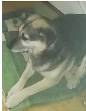
Tola assists at SP6JLW

SP9VFD: Raf rgrygorow@gmail.com report on 1296 during the ARRL Contest -- I was active in both recent legs of the ARRL EME Contest. I operated exclusively on random CW on 23 cm. It was my first participation on 1296. After over one year of construction of my HB 6.4 m f/d 0.4 dish, it was ready for use on moonbounce. In Nov leg of the contest my power was very low. I used a single MRFE6S9160 SSPA. My system was not checked or optimized. I still had a lot of fun when listening to own echoes regardless of the low power. For the final part, I built a new SSPA based on a W6PQL pallet. Two days before the contest, I installed the SSPA near my RA3AQ feed. Fortunately, all system worked properly. I measured system parameters with an SF=74 as follow: Sun/CS = 18.2 dB, CS/G = 6.7 dB and MN