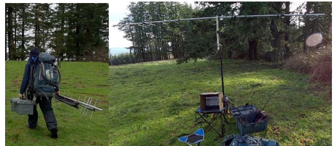
K7ATN climbing to portable location on right

KL6M: Mike melum@alaska.net reports a fantastic time on the ARRL Contest -- I normally try to work 432 thru 5760 over the three ARRL weekends. I was out of town for the microwave segment, and I was having trouble with my 432 system, so I decided to do concentrate on 23 cm operation for both weekends, on CW only. We were having abnormally cold WX, so I was not inclined to do troubleshooting or feed changes. I still have an intermittent power output problem, which seems to be in my PQL amp. I plan to replace the output chip caps. It could also be a power supply issue. I ended up with 90 QSOs on 23 cm over the two weekends. I should have had over 100 if things had gone as planned (without the technical difficulties). I had at least 10 more on my wanted list, but ran out of time. However, this is an all time high for me! My full log is viewable at kl6m.com .