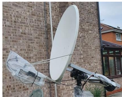
G4BAO's new 1.2 m dish with 24 GHz in place

G4BAO: John john@g4bao.com asks about 24 GHz operation with a RW1127 TWT -- I have successfully powered up my 24 GHz RW1127 TWTA with a fan cooling a heatsink. It produced 20 W at 130 mA Ic and 1.3 mA Ih. I have read various texts about intermittent CW keyed operation up to 35 W. Does anyone know what is a safe operating power for 60 sec on/off JT digimode operation? Has anyone made digimode QSOs with this tube? [PA7JB writes that his RW1127 can make 45 W, but runs 20 W in digital mode].