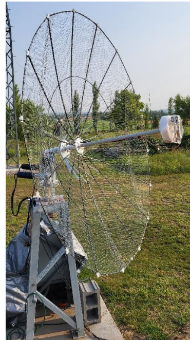
W2HRO new non-folding more rugged dish design

cm. The entire dish weighs 12 lbs and is nearly invisible. For more info contact https://sub-Lunar.com .