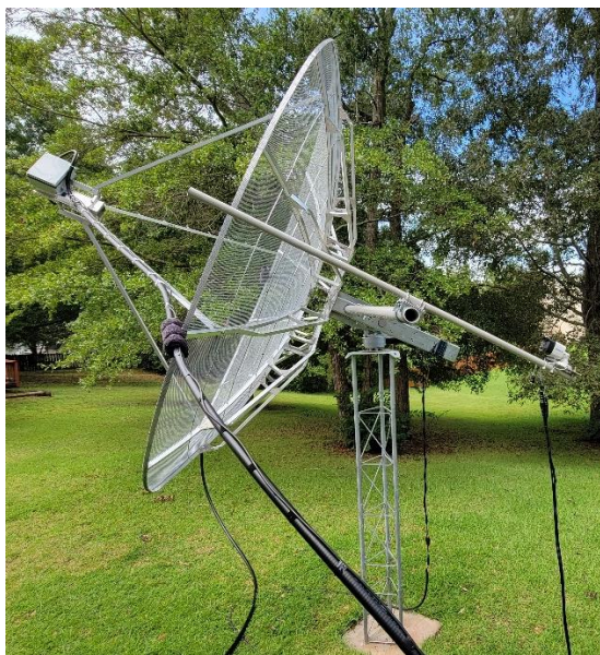
KU7XO's dish now used on 13 cm EME from SC

for XB. 2 initials were completed on 18 Aug with G4CCH (24DB) {#5} and W5LUA (16DB) {#6}. The system is a 3 m dish, 200 W Spectrian SCPA1063W SSPA and Green Heron Sub Lunar-1/RT-21 AZEL rotor control package.