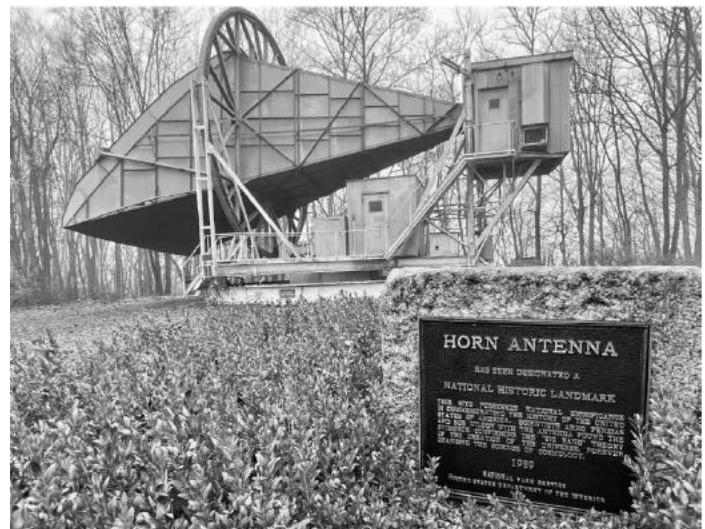
Antenna, at Crawford Hill in Holmdel Citizens for Informed Land Use

Below is the famous antenna used to detect the noise that led to the Big Bang Theory. It has been just designated a preserved site and saved from destruction by developers. It is among the places that can be visited when you come to EME2024 - Trenton.