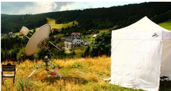
Micro dxpedition site at Zieleniec, SP/OK1DF