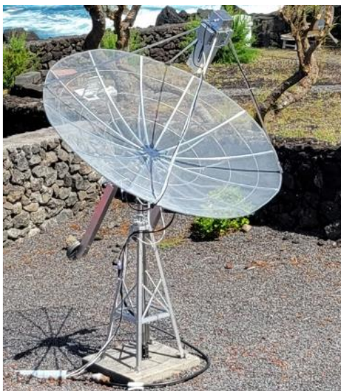
CT8/W6PQL 2.5 m dish used on 1296 in Pico Island

DXPEDITIONS: During the month CT8/W6PQL showed up on 1296 from Pico Island in the Azores (HM58rn) with a 2.5 m dish and 400 W. Jim has a summer home there and is expected to be active again – see QRZ. com.