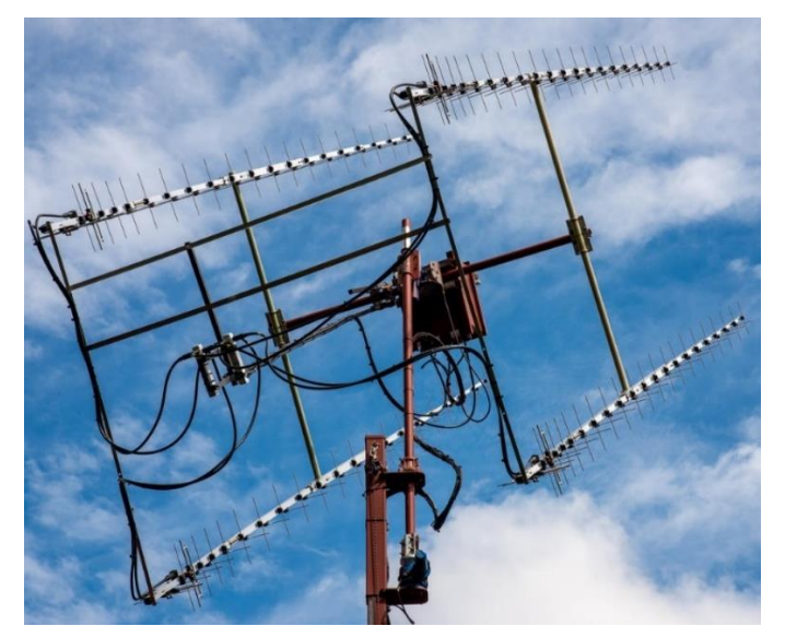
VK2CMP's 4 x 21 el X-pol yagi array used on 432 with 1 kW PA

VK2CMP: Mick vk2cmp@me.com is now up to mixed initial #99* on 432 EME - I spent my Xmas break moving the 10 m mast of my 4 x 21el X-pol yagi array to new footings further from the house. The old location prevented me from being able to lower the carriage/array down for maintenance and in storms. The array would slip in large winds and not being able to lower it, this meant that I just kept putting larger offsets in my PST rotator counter. I took the opportunity to up grade the array mounting and rotator. It now functions much better in poor weather. I also have adaptive pol. The 1st LNA is a cavity WD5AGO LNA, which has the 2nd stage replaced with a filter and in turn feeds a 2nd Kuhne LNA. On TX I have a Beko HLV-1470 PA which runs at 1kW that the special permit of my license allows. Since the last NL, I have added initials with W2HRO, WA5AFY and new DXCCs with IZ4FUA and NH6Y to bring me to initial #99*. Who will be 100? I have purchased a very very nice bottle of rum as an incentive and look forward to opening it when I work #100*. The bottle is sitting above the radio.