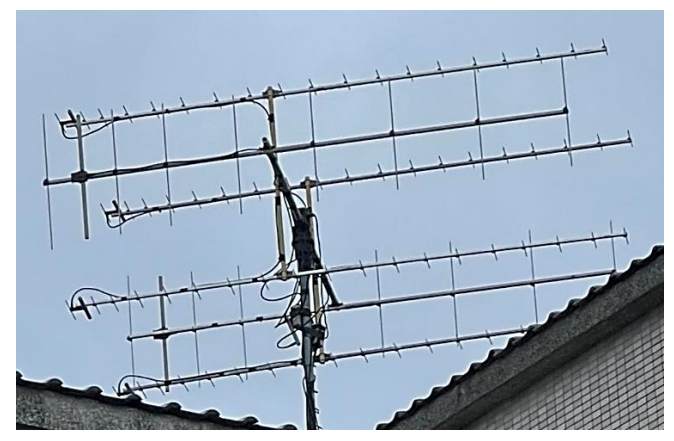
BV3CE's 4 x 20 el yagis on 70 cm

Congratulations go to HB9Q for receipt of 1296 WAS #6, VE4MA #8 and N5BF for WAS (#?), and to W5AFY for 432 WAS #31. Also IK2COJ reports completing 1296 DXCC on 21 Feb with ZL1NJR!