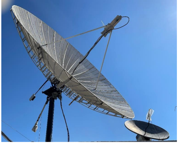
XE1XA's 5 m 30 year old dish still going strong – smaller dish used for space reception on microwaves