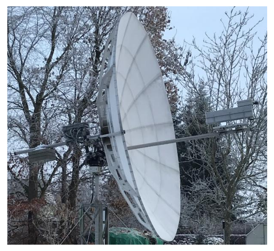
DL1SUZ's 3.2 m used 0n 23 and 13 cm

DL1SUZ: Uwe <u>dl1suz@t-online.de</u> made some 1296 EME SSB contacts during the SSB Funtest -- I QSO'd both DG5CST and OK2DL on SSB for a score 2x2x2x100 = 800 points! I also made CW initials with SA6BUN, LZ1DX, DL6SH und IK1FJI. My rig is a 3.2 m dish and 300 W. I'm working to complete my equipment for 9 cm EME and hope to make the 9 cm Dubus Contest weekend on 4/5 March. I will start with 50 W and a DDK 0.5 dB NF LNA with my present dish.